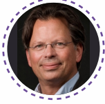
Wilco Peul Netherlands