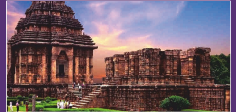
Konark Sun Temple

Chilika Lake, about 90 km to Bhubaneswar, is a brackish water lagoon, spread over the Puri, Khurda and Ganjam districts of Odisha state on the east coast of India. It is the largest coastal lagoon in India and the second largest lagoon in the world. It is the largest wintering ground for migratory birds on the Indian sub-continent