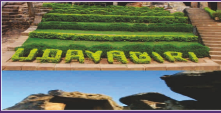
Udayagiri and Khandagiri

The caves, 6 km from West of Bhubaneswar city centre, were chiseled out for the ascetic Jain monks, also has some inscriptions describing the exploits of king Kharavel. The Caves are partly natural and partly artificial caves of archaeological, historical and religious importance. It is believed that most of these caves were carved out as residential blocks for Jain monks during the reign of King Kharavela. Udayagiri means "Sunrise Hill" and has 18 caves while Khandagiri has 15 caves.